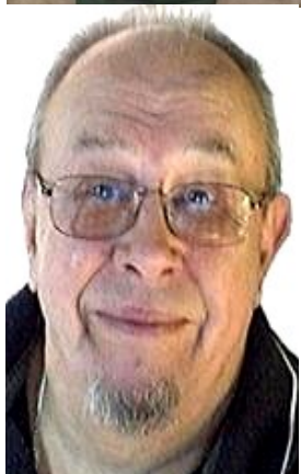
NEWSLETTER BERN CONNELL