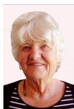
ASSISTANT Glen Keane